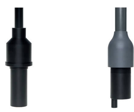
Typical installation of the probes with adapter and extension pipe.

0012.000624 Swivel mount to fix the probe to a standard handrail on the side of the tank. The supply includes 0012.450043 0012.440040 Hose for automatic air injection. Can be used with TU 8355 only.