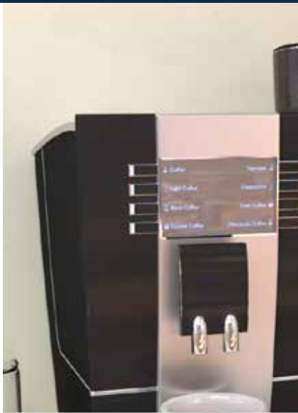
Coffee and vending machines