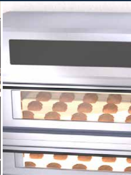
Heating and cooking equipment