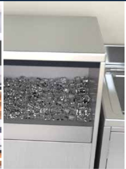
Ice makers and cooling systems